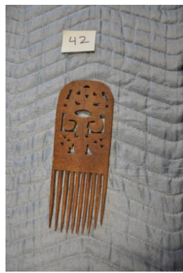
Primary Maker: Asante Cultural Group Nationality: Ghana, West Africa Hair Comb Date: early 20th century Credit Line: Gift of Drs. Carolyn and Eli Newberger Medium: wood Dimensions: 8 1/2 \times 3 1/2 in. (21.6 \times 8.9 \text{ cm}) Classification: WCMA

Reserve Collection Object number: RC.83.179