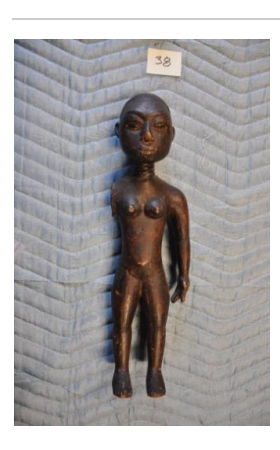
Primary Maker: Asante Cultural Group Nationality: Ghana, West Africa Female Sculpture Date: early 20th century Credit Line: Gift of Drs. Carolyn and Eli Newberger Medium: wood with multiple patinas (dark and occasionally metallic) Dimensions: 15 in. (38.1