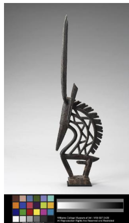
Primary Maker: Bamana Cultural Group Nationality: Mali, West Africa Ci-Wara Headdress Date: 19th-20th century Credit Line: Museum purchase, Karl E. Weston Memorial Fund Medium: wood Dimensions: Overall: 42 1/16 x 3 1/8 x 11 13/16 in. (106.8 x 8 x 30 cm) Classification: AFRICAN Object number: 70.5