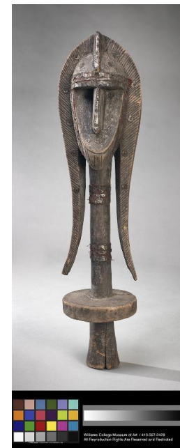
Primary Maker: Bamana Cultural Group Nationality: Mali, West Africa Merekun (Marionette) Date: 20th century Credit Line: Gift of Douglas K. Stevens, Jr., Class of 1966 Medium: wood and repoussé metal Dimensions: Overall: 24 3/16 x 5 7/8 x 5 11/16 in. (61.5 x 15 x 14.5 cm) Classification: AFRICAN Object number: 76.25