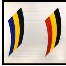
Primary Maker: Charles B. Hinman Nationality: American Untitled Date: 1970 Credit Line: Gift of Sam Hunter, Class of 1944 Medium: color silkscreen and embossing on paper Dimensions: Overall: 25 3/8 x 25 1/2 in. (64.4 x 64.8 cm) Classification: PRINTS Object number: 70.29.D