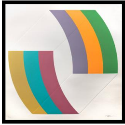
Primary Maker: Charles B. Hinman Nationality: American Untitled Date: 1970 Credit Line: Gift of Sam Hunter, Class of 1944 Medium: color silkscreen and embossing on paper Dimensions: Overall: 25 3/8 x 25 1/2 in. (64.4 x 64.8 cm) Classification: PRINTS Object number: 70.29.C