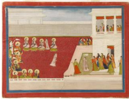
Illustration (from a "Nala Damayanti" series)