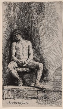
Primary Maker: Rembrandt van Rijn Nationality: Dutch Study from the nude: Man seated before a curtain Date: 1646 Credit Line: Museum purchase, with funds provided by the Assyrian Relief Exchange Medium: etching on paper Dimensions: Overall: 6 1/2 x 3 3/4 in. (16.5 x 9.5 cm) Classification: PRINTS Object number: 41.13.2