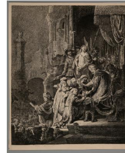
Primary Maker: Rembrandt van Rijn Nationality: Dutch Christ Before Pilate Date: no date Credit Line: Anonymous gift Medium: photogravure Dimensions: sheet: 26 x 18 7/8 in. (66 x 48 cm) Classification: WCMA Reserve Collection Object number: RC.4.4