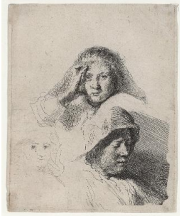
Primary Maker: Rembrandt van Rijn Nationality: Dutch Three Heads of Women Date: c. 1637 Credit Line: Museum purchase, with funds provided by the Assyrian Relief Exchange Medium: etching on paper Dimensions: Overall: 4 15 /16 x 4 1/16 in. (12.6 x 10.3 cm) Classification: PRINTS Object number: 41.13.1