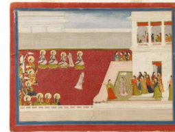
Illustration (from a "Nala Damayanti" series)