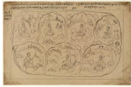
Illustration (from a "Bhagavata" series)