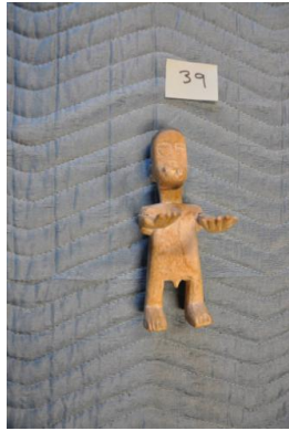
Figure (standing with arms raised) Credit Line: Gift of Drs. Carolyn and Eli Newberger Medium: unidentified medium Classification: WCMA Reserve Collection Object number: RC.83.176