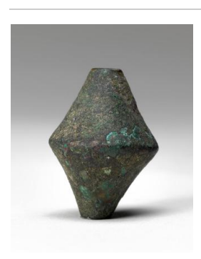
Primary Maker: Anonymous