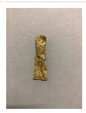
Primary Maker: Greek? Bead with pattern Date: 800-700 BC Credit Line: Collection of the Son and Daughters of Charles Bolles BollesRogers, Class of 1907 Medium: gold Dimensions: Overall: 1 11 /16 x 9/16 in. (4.3 x 1.4 cm) Classification: ANCIENT Object number: EL.75.3.7.A