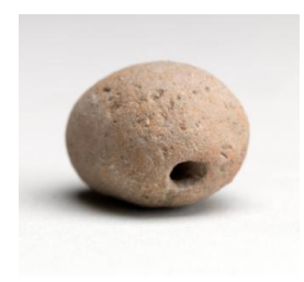
Primary Maker: Ancient Bead Date: no date Credit Line: Found in the collection and catalogued, 1993 Medium: baked clay Dimensions: Overall: 1 1/8