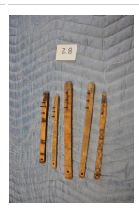
Primary Maker: Dogon Cultural Group Nationality: Mali, West