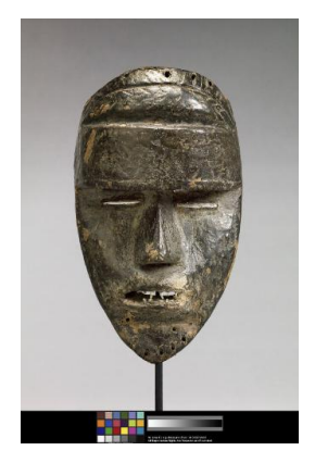
Primary Maker: Dan Cultural Group Nationality: Côte d'Ivoire

Nationality: Côte d'Ivoire and/or Liberia, West Africa