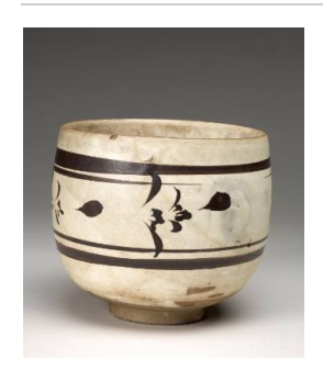
Primary Maker: Shaanxi Province, China