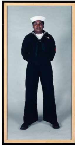
Primary Maker: Catherine Opie Nationality: American Renee Date: 1994 Credit Line: Museum purchase, Wachenheim Family Fund Medium: chromogenic print Dimensions: 60 x 30 in. (152.4 x 76.2 cm) frame: 61 3/4 x 21 1/4 x 2 in. (156.8 x 54 x 5.1 cm) Classification: PHOTO Object number: M.2016.19