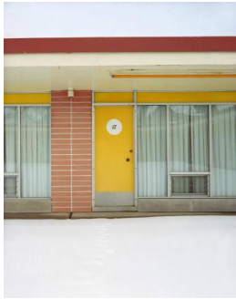
Primary Maker: Alec Soth Nationality: American Cadillac Motel Date: 2005 Credit Line: Museum purchase, Wachenheim Art Fund Medium: chromogenic print Dimensions: 40 x 32 in. (101.6 x 81.3 cm) Classification: PHOTO Object number: M.2009.5