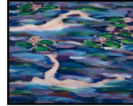
Primary Maker: Salomé Nationality: German Sommer Schwimmer Date: 1990 Credit Line: Gift of the artist Medium: acrylic on canvas Dimensions: Overall: 48 x 60 1/2 in. (121.9 x 153.7 cm) Classification: WCMA Reserve Collection Object number: RC.45