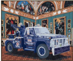
Primary Maker: Salvatore Gulino Nationality: American Tow Truck Date: 1975 Credit Line: Museum purchase, Greylock Foundation Medium: acrylic on canvas Dimensions: frame: 40 1/4 x 48 1/4 in. (102.2 x 122.5 cm) Classification: PAINTING Object number: 75.30