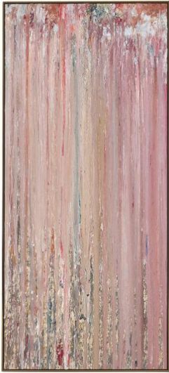
Primary Maker: Larry Poons Nationality: American Small One Date: 1975 Credit Line: Anonymous gift Medium: acrylic on canvas Dimensions: frame: 96 5/8 x 43 5/16 in. (245.5 x 110 cm) Classification: PAINTING Object number: 83.27