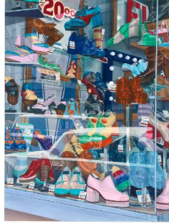
Primary Maker: Don Eddy Nationality: American New Shoes Date: 1973 Credit Line: Museum purchase, Karl E. Weston Memorial Fund Medium: acrylic on canvas Dimensions: frame: 64 x 48 1/4 x 1 3/4 in. (162.6 x 122.6 x 4.4 cm) Classification: PAINTING Object number: 73.56