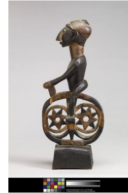
Primary Maker: Republic of Benin Nationality: West Africa Transitional Figure of a Bicycle Rider Date: ca. 1910-30 Credit Line: Museum purchase, Karl E. Weston Memorial Fund Medium: wood Dimensions: Overall: 18 3/4 x 7 7/8 x 3 1/8 in. (47.6 x 20 x 8 cm) Classification: AFRICAN Object number: 82.4