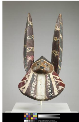
Primary Maker: Yoruba Cultural Group Nationality: Nigeria, West Africa Apasa Dance Mask Date: 20th century Credit Line: Gift of Roda and Gilbert Graham Medium: wood and pigment Dimensions: Overall: 15 1/2 x 11 5/8 x 15 15/16 in. (39.3 x 29.5 x 40.5 cm) Classification: AFRICAN Object number: 92.4