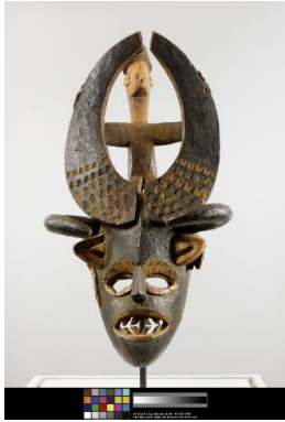
Primary Maker: Igbo Cultural Group Nationality: Nigeria, West Africa Mgbedike Mask Date: 20th century Credit Line: Gift of Albert F. Gordon Medium: wood Dimensions: Overall: 34 1/4 x 15 3/8 x 16 3/4 in. (87 x 39 x 42.5 cm) Classification: AFRICAN Object number: 91.44.4