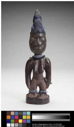
Primary Maker: Yoruba Cultural Group Nationality: Nigeria, West Africa Ere Ibeji Twin Figure Date: 19th-20th century Credit Line: Gift of Scott Alan Krol Medium: wood, beads and metal Dimensions: Overall: 11 13/16 x 3 5/8 in. (30 x 9.2 cm) Classification: AFRICAN Object number: 91.45.3