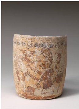
Primary Maker: Maya Nationality: Mesoamerican Vase Date: Late Classic, 600-900 AD Credit Line: Gift of Herbert D. N. Jones, Class of 1914 Medium: clay Dimensions: Overall: 5 7/8 in. (15 cm) Base: 4 1/2 in. (11.4 cm) Classification: AMERINDIAN Object number: 21.1.11