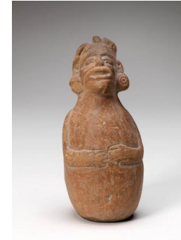
Primary Maker: Maya Nationality: Mesoamerican Rattle figurine Date: Late Classic, 600-900 AD Credit Line: Gift of Herbert D. N. Jones, Class of 1914 Medium: mold-made terracotta Dimensions: Overall: 5 1/4 x 2 9/16 x 1 15/16 in. (13.3 x 6.5 x 5 cm) Classification: AMERINDIAN Object number: 21.1.4