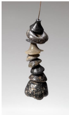
Primary Maker: Maya Nationality: Mesoamerican Jade Beads Date: 600-900 AD Credit Line: Found in the collection and catalogued, 1993 Medium: jade Dimensions: Overall: 4 5/16 in. (11 cm) Classification: AMERINDIAN Object number: 93.1.16.C