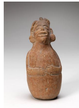
Primary Maker: Maya Nationality: Mesoamerican Rattle figurine Date: Late Classic, 600-900 AD Credit Line: Gift of Herbert D. N. Jones, Class of 1914 Medium: mold-made terracotta Dimensions: Overall: 5 1/4 x 2 9/16 x 1 15/16 in. (13.3 x 6.5 x 5 cm) Classification: AMERINDIAN Object number: 21.1.4