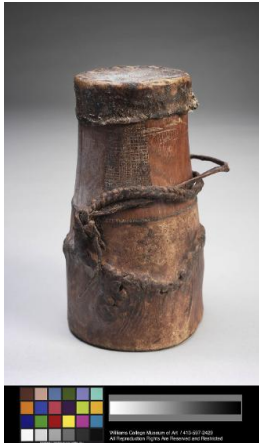
Primary Maker: Turkana Cultural Group Nationality: Kenyan, East Africa "Eburi" Fat Container with Lid Date: 19th-20th century Credit Line: Museum purchase, John B. Turner '24 Memorial Fund Medium: wood and leather Dimensions: Overall: 6 11/16 x 3 15/16 in. (17 x 10 cm) Classification: AFRICAN Object number: 84.13.16