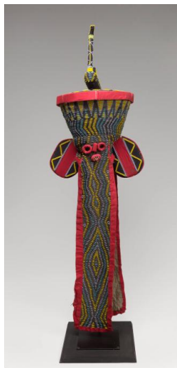
Primary Maker: Bamileke Cultural Group Nationality: Cameroon, West Africa Elephant Mask Date: 20th century Credit Line: Gift of Albert F. Gordon Medium: bead embroidered cloth Dimensions: Overall: 44 5/16 x 13 3/4 in. (112.5 x 35 cm) Classification: WCMA Reserve Collection Object number: RC.11.3