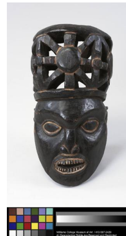
Primary Maker: Bamum Cultural Group Nationality: Cameroon, West Africa Headdress with Earth Spider Motif Date: 19th-20th century Credit Line: Museum purchase, Joseph O. Eaton Fund Medium: wood Dimensions: Overall: 18 11/16 x 11 7/16 x 13 3/8 in. (47.5 x 29 x 34 cm) Classification: AFRICAN Object number: 71.4