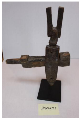
Primary Maker: Bamana Cultural Group Nationality: Mali, West Africa Granary Door Lock Date: early 20th century Credit Line: Gift of Drs. Carolyn and Eli Newberger Medium: wood, mounted to metal stand Dimensions: 18 x 16 x 3 in. (45.7 x 40.6 x 7.6 cm) Classification: WCMA Reserve Collection Object number: RC.83.248