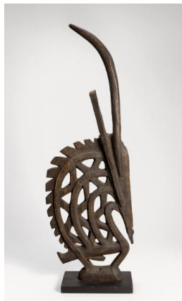
Primary Maker: Bamana Cultural Group Nationality: Mali, West Africa Ci-Wara headdress Date: 19th-20th century Credit Line: Gift of Scott Alan Krol Medium: wood Dimensions: Overall: 30 x 2 1/2 x 9 15/16 in. (76.2 x 6.4 x 25.2 cm) Classification: WCMA Reserve Collection Object number: RC.6.1