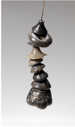
Primary Maker: Maya Nationality: Mesoamerican Jade Beads Date: 600-900 AD Credit Line: Found in the collection and catalogued, 1993 Medium: jade Dimensions: Overall: 4 5/16 in. (11 cm) Classification: AMERINDIAN Object number: 93.1.16.C