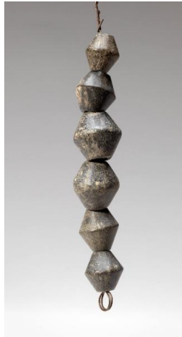
Primary Maker: Maya Nationality: Mesoamerican Jade Beads Date: 600-900 AD Credit Line: Found in the collection and catalogued, 1993 Medium: jade Dimensions: Overall: 5 1/8 in. (13 cm) Classification: AMERINDIAN Object number: 93.1.16.B