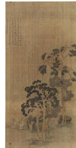
Primary Maker: Anonymous (Chinese) Nationality: Chinese Two sages accompanied by servants amid pine and Wu-tung trees Date: 15th or 16th century Credit Line: Selection from the Peterson Collection, Gift of William Bingham II Medium: color on silk Dimensions: Overall: 21 1/2 x 10 15/16 in. (54.6 x 27.8 cm) Classification: EASTERN Object number: 41.15.37