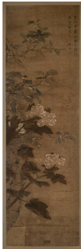
Primary Maker: 'Ye T'ung Nationality: Chinese Flower Still-Life Date: Ming Dynasty Credit Line: Selection from the Peterson Collection, Gift of William Bingham II Medium: color on silk Dimensions: frame: 57 1/2 x 21 1/8 in. (146 x 53.6 cm) Classification: EASTERN Object number: 41.15.16