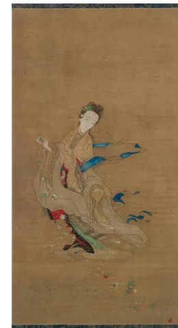
Primary Maker: Anonymous (Chinese) Nationality: Chinese Portrait of a heavenly fairy Date: 17th-18th century Credit Line: Selection from the Peterson Collection, Gift of William Bingham II Medium: color on silk Dimensions: frame: 34 7/16 x 21 7/16 in. (87.5 x 54.5 cm) Classification: EASTERN Object number: 41.15.39