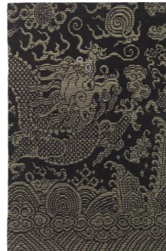
Primary Maker: After Chou Ch'ên Twelve portraits of national officials and heroes of the Ming Dynasty Date: 19th century Credit Line: Selection from the Peterson Collection, Gift of William Bingham II Medium: color on silk Dimensions: Overall: 11 1/2 x 7 3/16 x 13/16 in. (29.2 x 18.2 x 2 cm) Classification: EASTERN Object number: 41.15.45