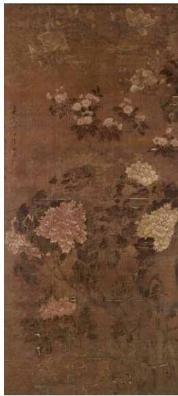
Primary Maker: Chou Jen-ho Nationality: Chinese Flower still-life Date: 1804? Credit Line: Selection from the Peterson Collection, Gift of William Bingham II Medium: color on silk Dimensions: Overall: 41 9/16 x 20 1/16 in. (105.5 x 51 cm) Classification: EASTERN Object number: 41.15.14