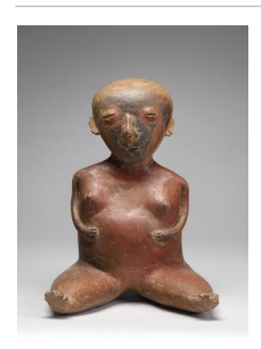
Nationality: Mexican Seated pregnant woman Date: Late Pre-classic, 300 BC- 300 AD Credit Line: Museum purchase Medium: red terracotta Dimensions: Overall: 12 x 8

Classification: AMERINDIAN Object number: 40.2