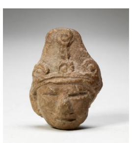
Primary Maker: Mexican Head Date: Early Classic, 150300 AD Credit Line: Gift of Henry E. Catto, Jr., Class of 1952 Medium: painted clay Dimensions: Overall: 1 9 /16 x 1 1/8 x 13/16 in. (4 x 2.8 x 2 cm) Classification: AMERINDIAN