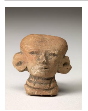
Primary Maker: Mexican Head Date: 350-750 CE Credit Line: Gift of Henry E. Catto, Jr., Class of 1952 Medium: painted clay Dimensions: Overall: 1 3/8 x 1 7/16 in. (3.5 x 3.7 cm) Classification: AMERINDIAN Object number: 50.10.A