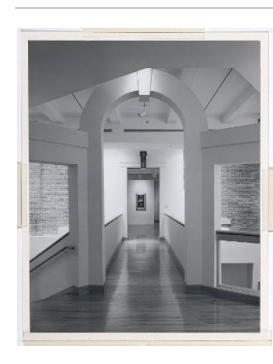
Primary Maker: Ralph Lieberman

Nationality: American Untitled: Interior view of the Williams College Museum of Art